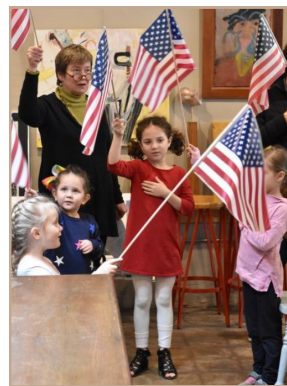
The photo was taken at the March Civic Saturday event.