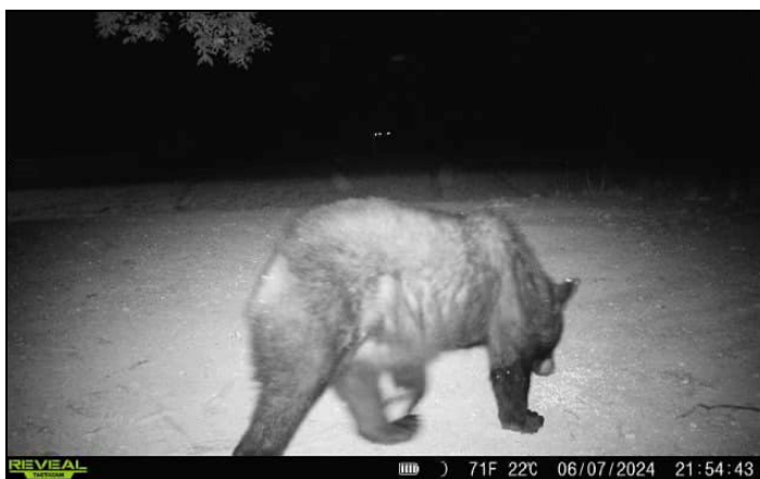
REVEAL 71F 22C 06/07/2024 21:54:43

WTI crude oil prices rose by 82 cents to $74.07 per barrel at the close of Wednesday's trading session, down from $77.91 the previous Thursday. The EIA reports a 1.2 million barrel increase in crude oil inventories, totaling 455.9 million barrels, which is about 4% below the five-year average for this time of year.