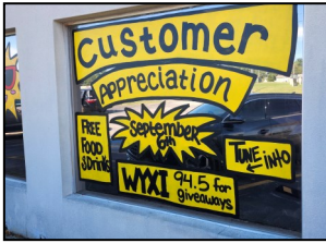
Sign at Hennessee Hydraulics

WYXI Radio FM 94.5/AM 1390 was pleased to have recently participated in live promotional events for Hennessee Hydraulics and the McMinn Senior Activity Center. Hennessee was celebrating its first year in the Friendly City and held a Customer Appreciation Day on Friday, providing free food for guests. The McMinn Senior Activity Center was celebrating 50 years in Athens on Monday and did so with a "Legislative Breakfast" opening the day with local elected officials. The fun continued with a live broadcast from WYXI Radio. WYXI provided music and held many giveaways at both events. Below are pictures from the festivities.